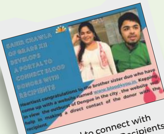
A Portal to connect with Blood donors with Recipients

Christmas is a month of sharing, forgiveness and spreading happiness and joy in the world. So to celebrate Christmas a season of sharing and supporting the homeless and vulnerable, an Advent Calendar activity was conducted. The students were encouraged to gather all essential things like food, clothing etc from 1st December and drop them at their local animal shelter, orphanages or old homes on Christmas Eve as a Christmas present to someone that really needed it.