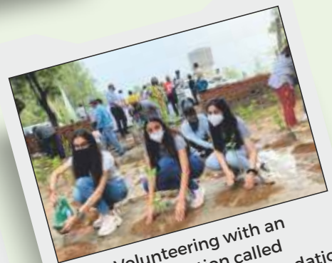
Volunteering with an organisation called 'Youth Empowerment Foundation'