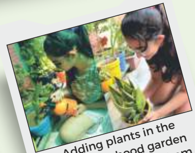
Adding plants in the neighbourhood garden and taking care of them