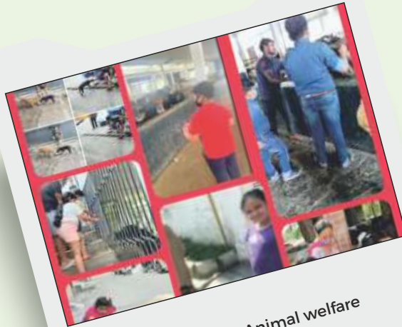
Supporting Animal welfare