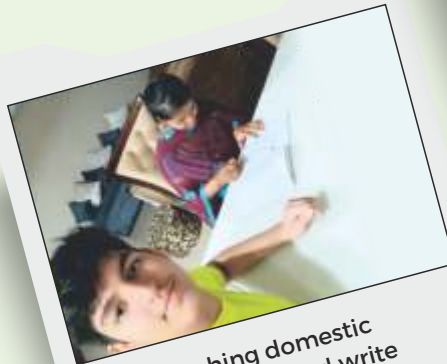
Teaching domestic help to read and write