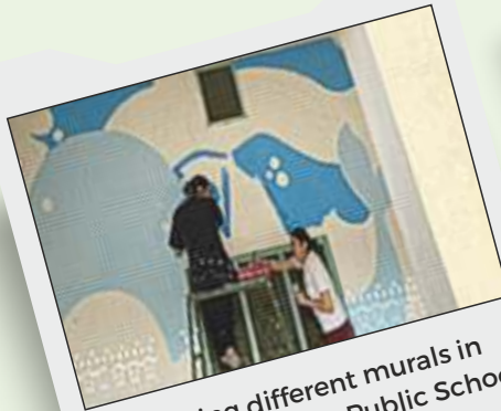
Painting different murals in Guru Teg Bahadur Public School