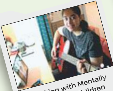
Working with Mentally Challenged Children

WE teach, YOU learn and the WORLD benefits!