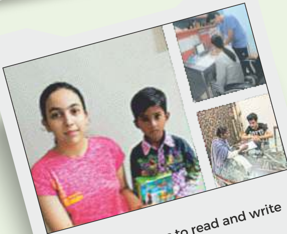
Teaching others to read and write